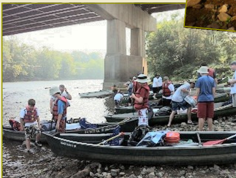
Left: The guys prepare to put in at Connellsville. Above: Heavily loaded kayaks. Right: Choice site for tent dwellers.