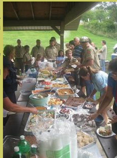
Our 2009 Fall Court of Honor and end-of-summer picnic was held at Oak Hollow Park on Sunday, August 23rd.